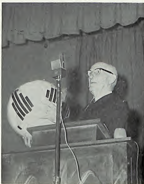
Dr. Frank Laubach